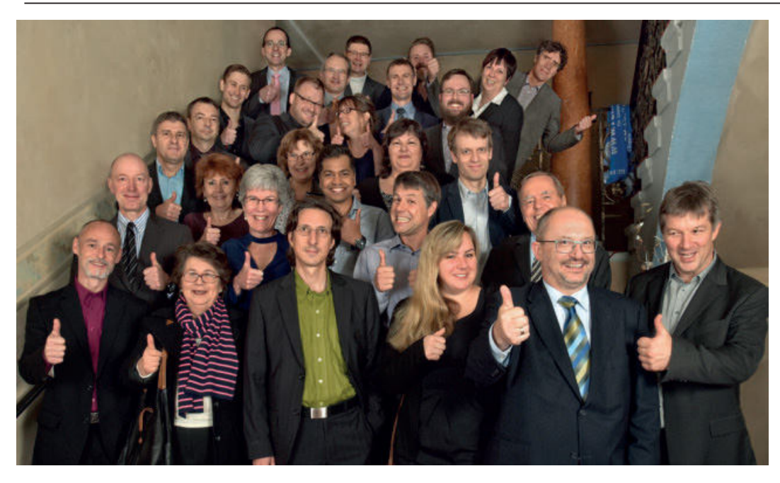
Some of SoftDeCC's Development and Service Team during celebrations in 2018

TCmanager® occurred with the introduction of the new Web client in 2016. This client replaced the previous client/server solution and added numerous new webbased features. Step by step, TCmanager® Seminar Management has transformed into a web-based LMS with comprehensive qualification management and responsive learning portals for employees (ESS). For trainers, executives (MSS), and administrators, dedicated portal access points offer individualized information and functionality spectrums.